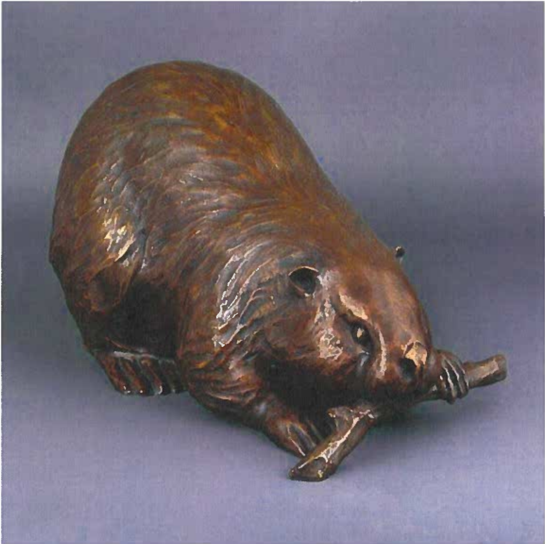
Beaver with Stick

Two beaver sculptures and two otter sculptures