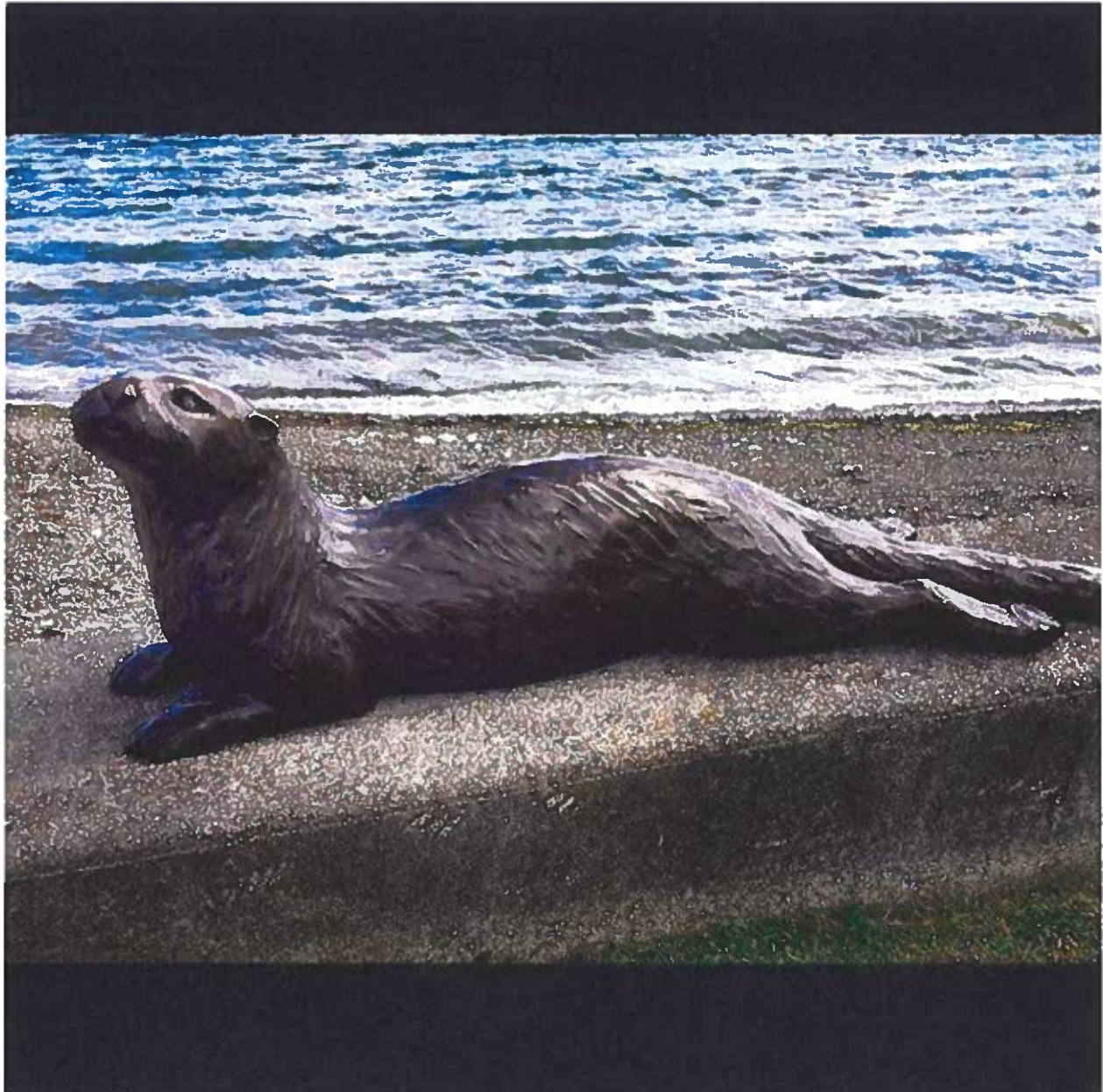
Ayock Otter Stretching

12" H X 41" W X 12" D approx. weight 45 lbs.