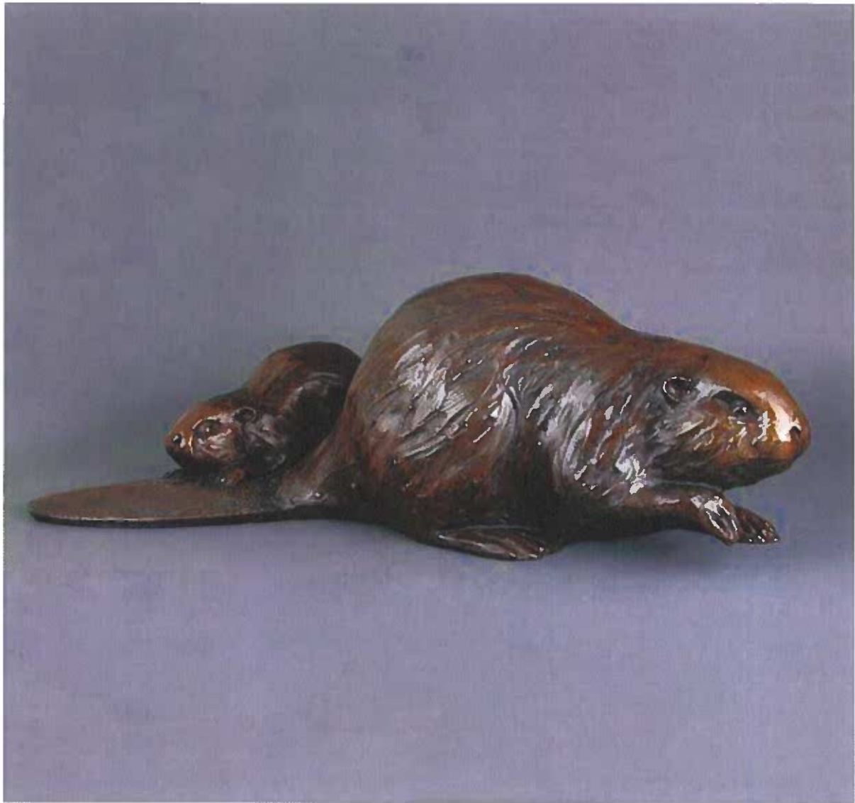
Beaver with Pup

11" H X 33" W X 17"D approx. weight 50 lbs.