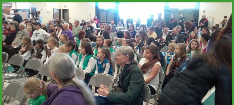
Veterans Recognition Ceremony on November 8, 2014

Saturday, December 20, 10:00-11:00 am Skagit Valley Food Co-op, Mezzanine Area 202 S. First Street