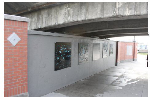
Skagit River Jam Memorial