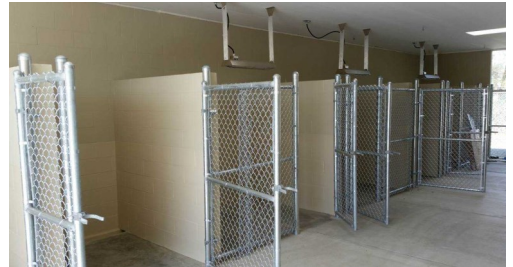
New Kennel Holding Pens