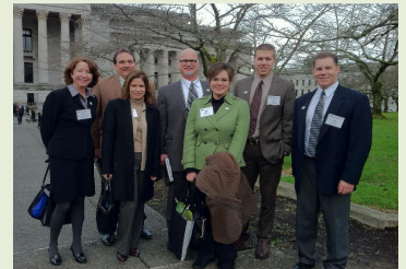
Olympia Meetings with our Elected Officials

I want to thank our City Council for a warm welcome, and I am enjoying the collaborative relationship. Our City staff has jumped right in as a team, and we have some good accomplishments already!