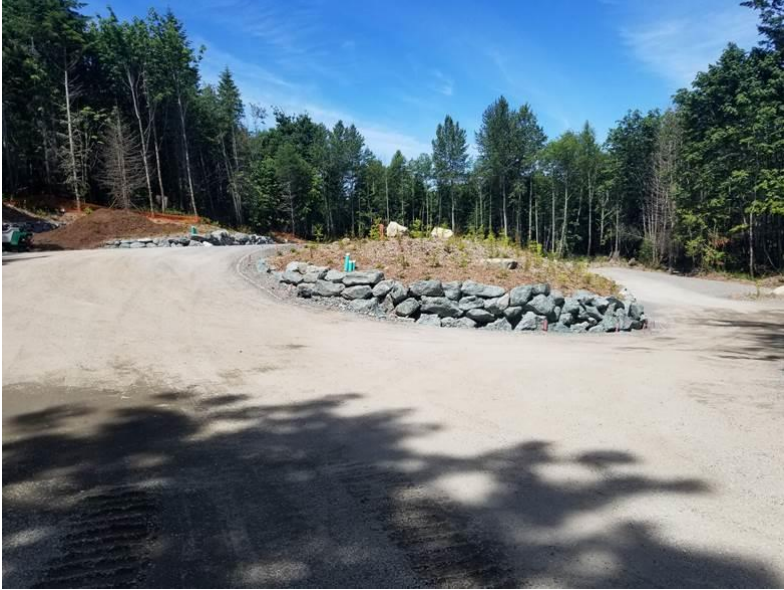
New Little Mountain parking lot is ready for paving