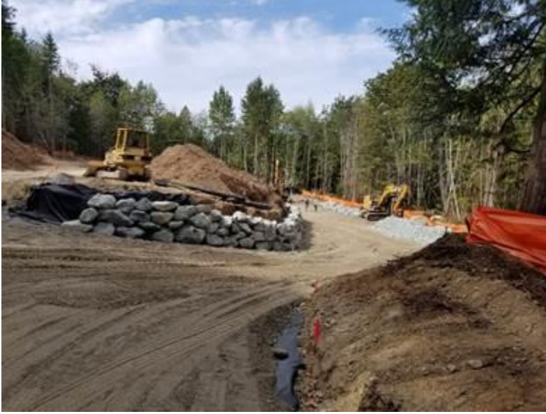
From October 2019: Landscape construction at the lot site