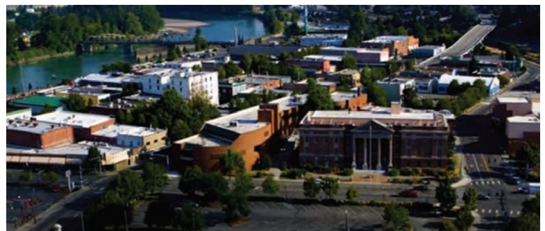
Aerial view of the project site from fundraising video