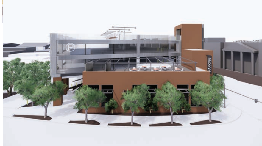
Preliminary Massing Models without lighting and with placeholder materials to be developed